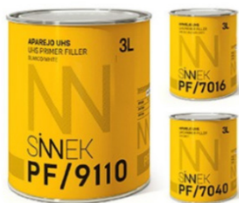
PF/9110 PF/7016 PF/7040

Nozzle 1.4 - 1.8 Air cap GTO EPA Maximum Pressure 1.5 - 2.0 Bar