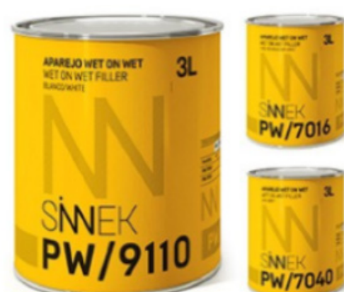
PW/9110 PW/7016 PW/7040

Nozzle 1.2 - 1.2XL Air cap DVR CLEAR PRO Maximum Pressure 1.8 - 2.2 Bar